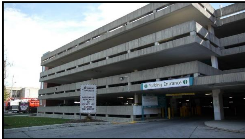
Main Parking Garage on 835 King St. West.

The Parking Office can also help you to reserve a parking spot in advance of your visit. Spots are free on the 1st floor of the main parking garage.