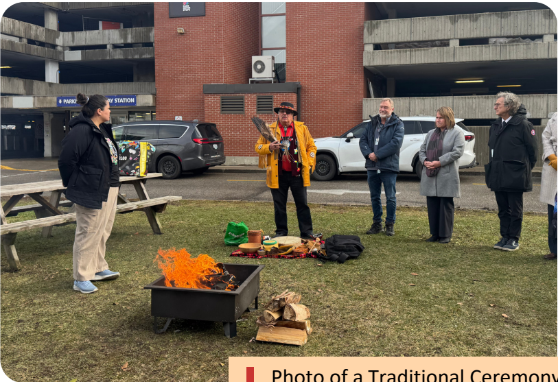
Photo of a Traditional Ceremony at Waterloo Regional Health Network.